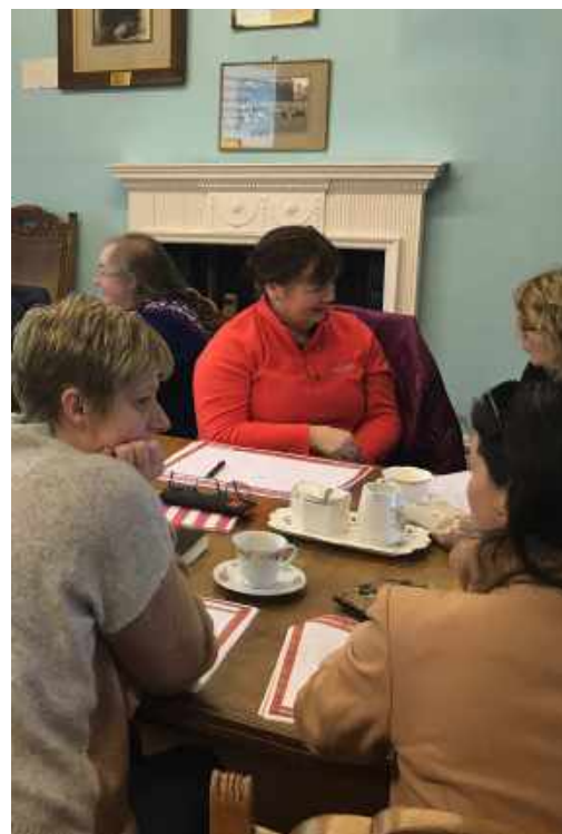
Above: Strichen Workshop

For participants who had attended the one-day workshops in Banff and Peterhead and wanted to develop their business ideas further, the LINA Accelerator provides a set of six workshops taking place monthly. Using RGU's online delivery platform Campusmoodle and virtual classroom; Blackboard Collaborate, it was possible to take these sessions online without changing the schedule.