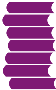
Books/Stationery/ Photocopying £25 to £45 per month