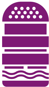
Eating Out £7 to £15