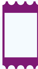
Cinema Ticket £6 to £8

*If you are under 22 and have a Young Scot card you may be eligible for free bus travel across Scotland!