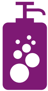
Toiletries/Food £40 per week