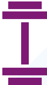
RGU SPORT Free to £30 per month