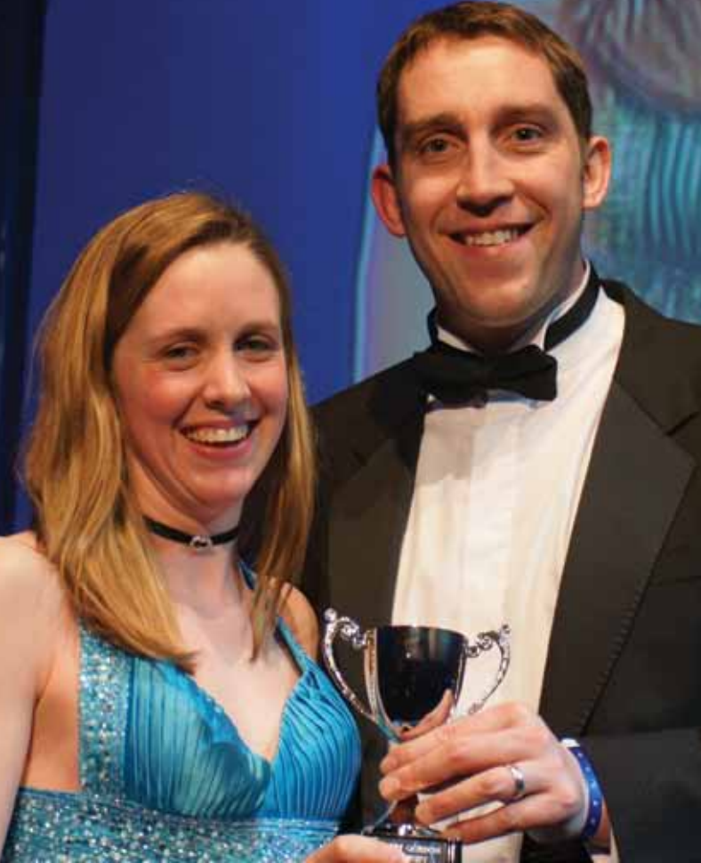
Hannah Miley (Sports Person of the Year) with Steve Parry.