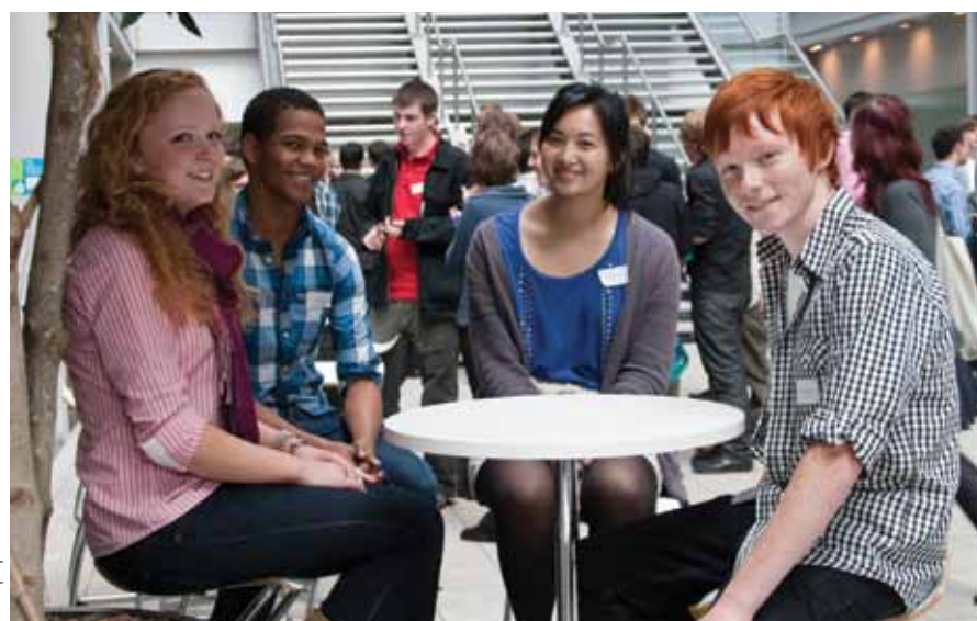
RCU pupils at the Conference.